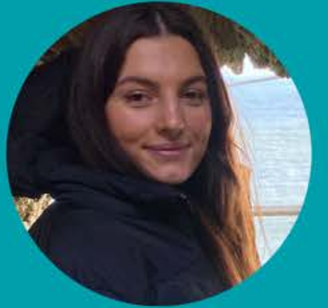
Ocean Explorer Academy

Our regular electrical volunteer turns up at numerous Repair Cafes ready to help fix any electrical items bought in by the public. He even has his own badge!